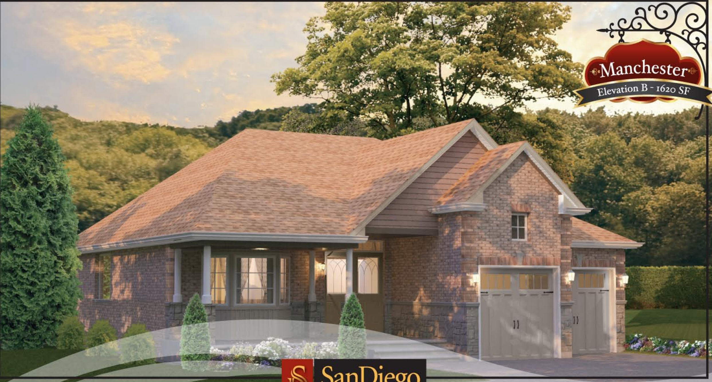
Manchester Elevation B - 1620 SF