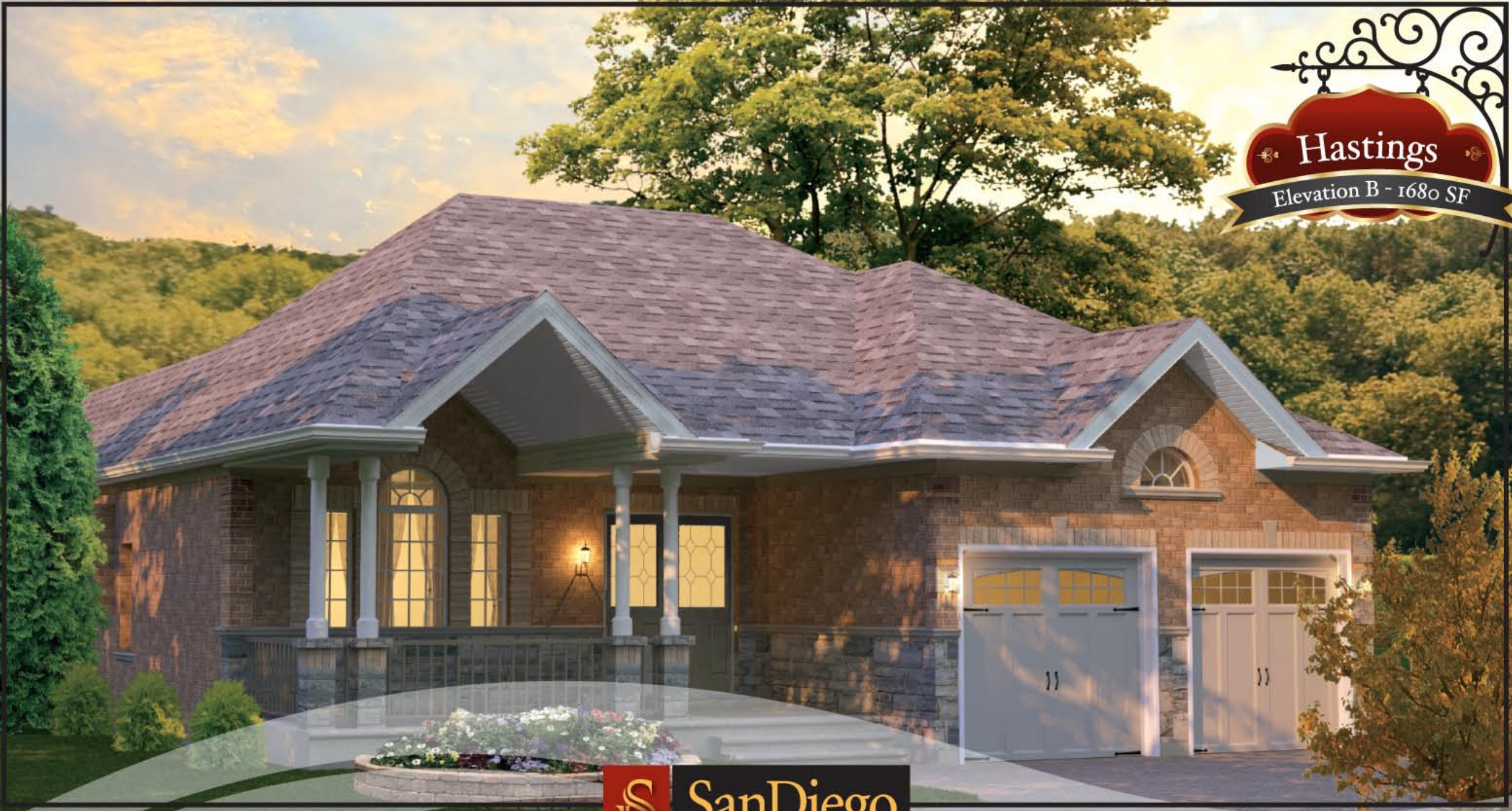
Hastings Elevation B - 1680 SF