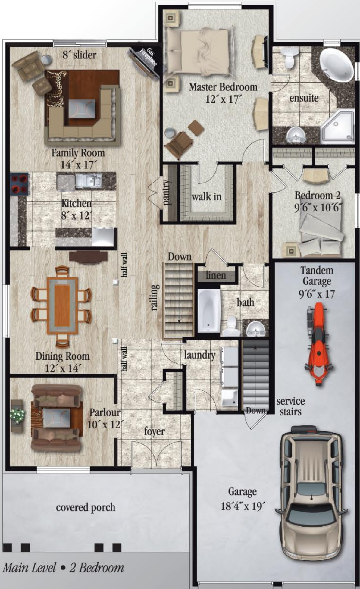
Main Level • 2 Bedroom