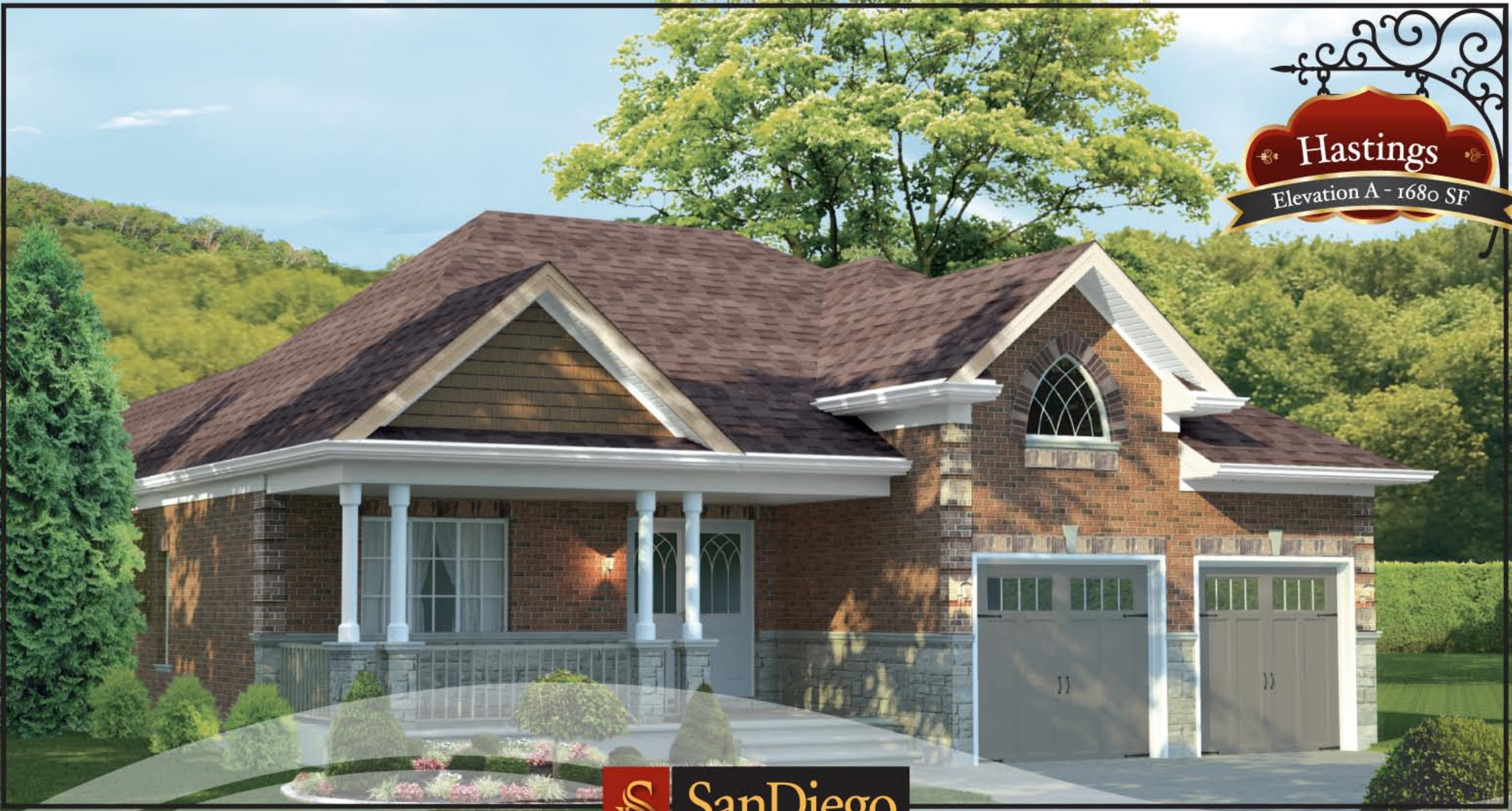
Hastings Elevation A - 1680 SF