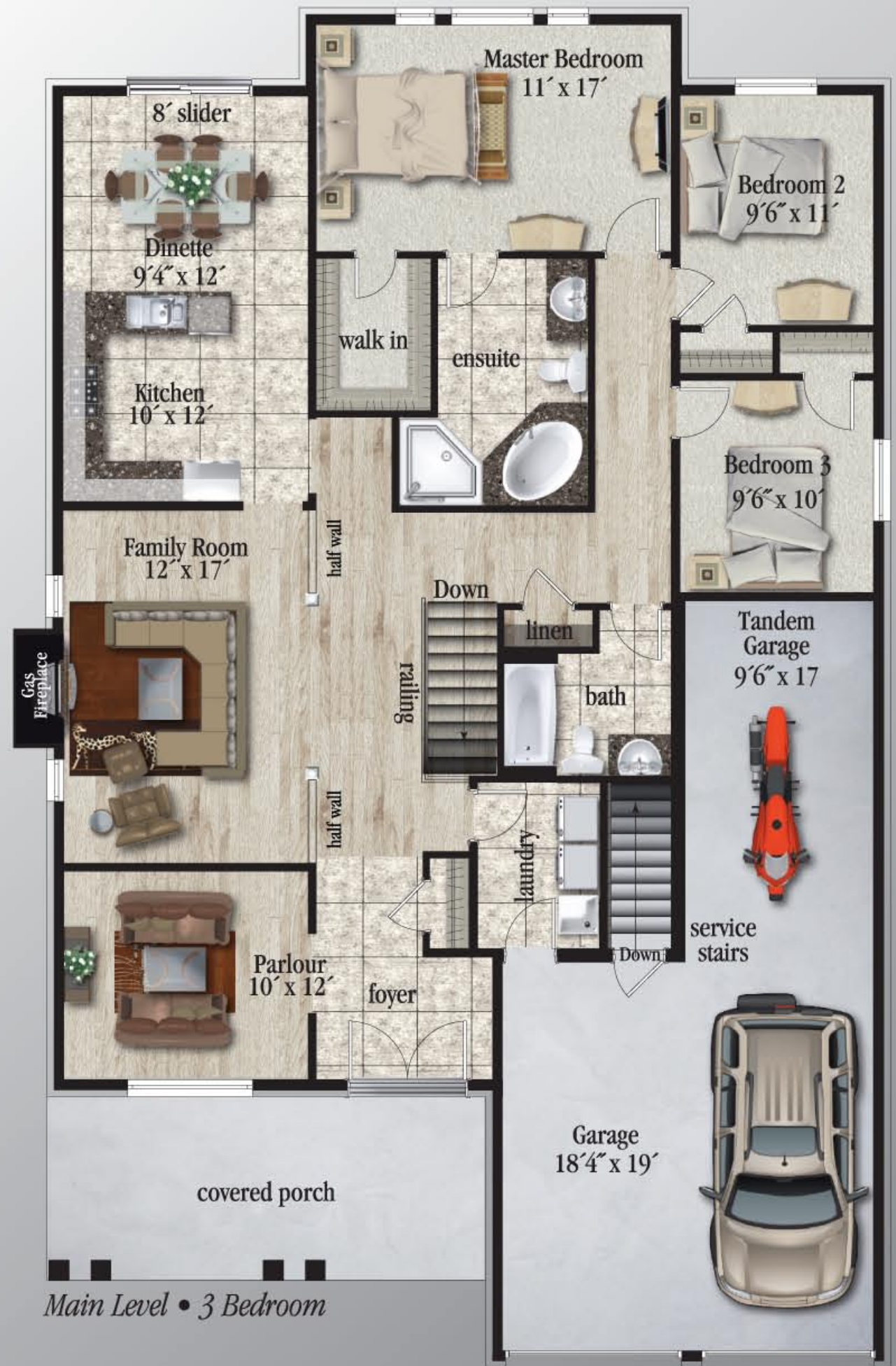
Main Level • 3 Bedroom